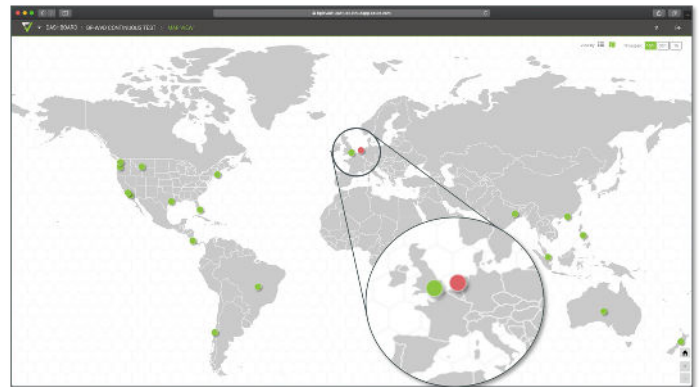
Figure 3 – Login Enterprise evaluates real-time performance and availability by location to alert against issues 24/7/365.

same region as an AVD deployment, across a continent, or worldwide. The ability to measure end user experience from multiple viewpoints provides invaluable insight into your AVD deployment. As a result, you can generate SLA Reports not based on the application, but on regional performance from your end users' perspective, including offshore and nearshore resources.